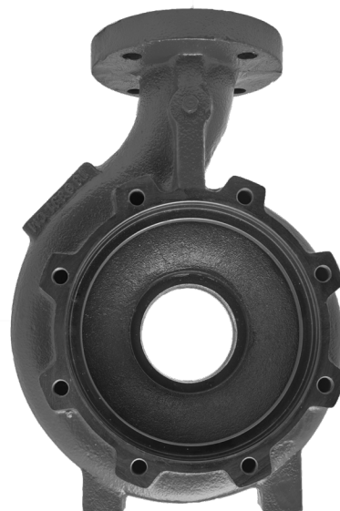
FIGURE 3: CASING WITH E-COATING

For best efficiency, reduced maintenance and repair costs, and improved uptime, E-coating is always recommended for pumps.